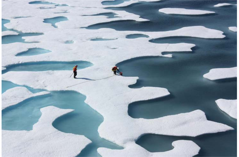
Two administrators proceeding without the help of ELR.